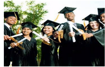
A Mind is a terrible thing to waste—Arthur Fletcher