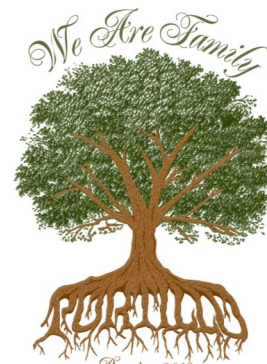
Robinson Roots Family